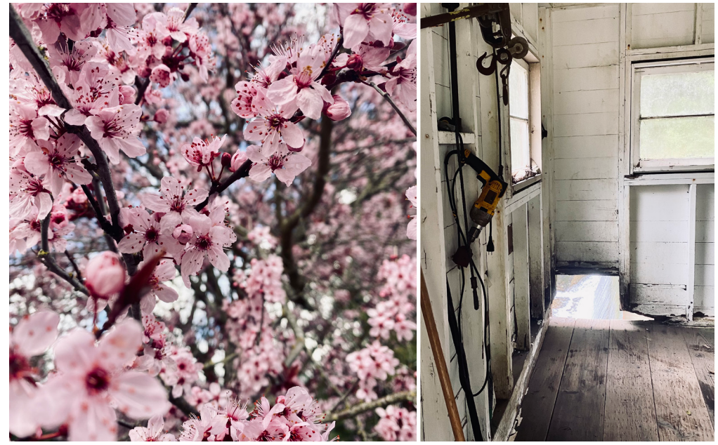
April cherry blossoms and (at right) a view of the Big Quilcene River diversion control valve building. Rehabilitation of the structure is one of the Capital Projects in the 2025 Budget.